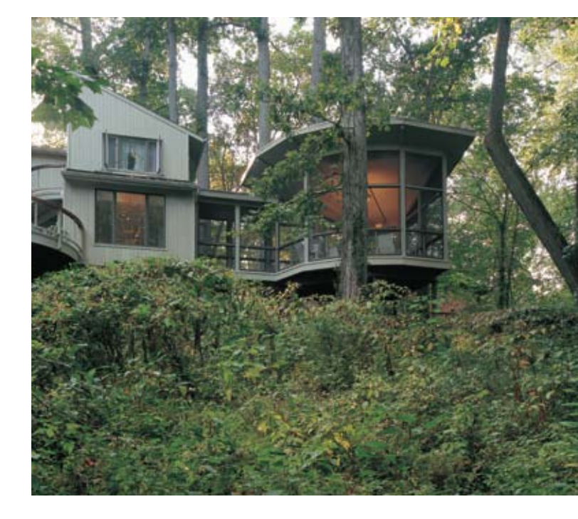
There's a sculptural balance between the free-form porch and the severely angular contemporary home that was reborn, thanks in large part to the addition of the new porch.

The success of this project, she says, is how comfortable it feels on the property, and how well it stands in harmony with nature.