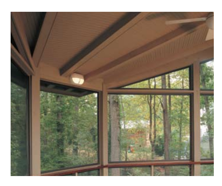
Curves soften the edginess of the fan-shaped space. The porch has a light industrial feel with steel bolts and wires; its roof rafters stretch across the ceiling, open-armed, to the sky.