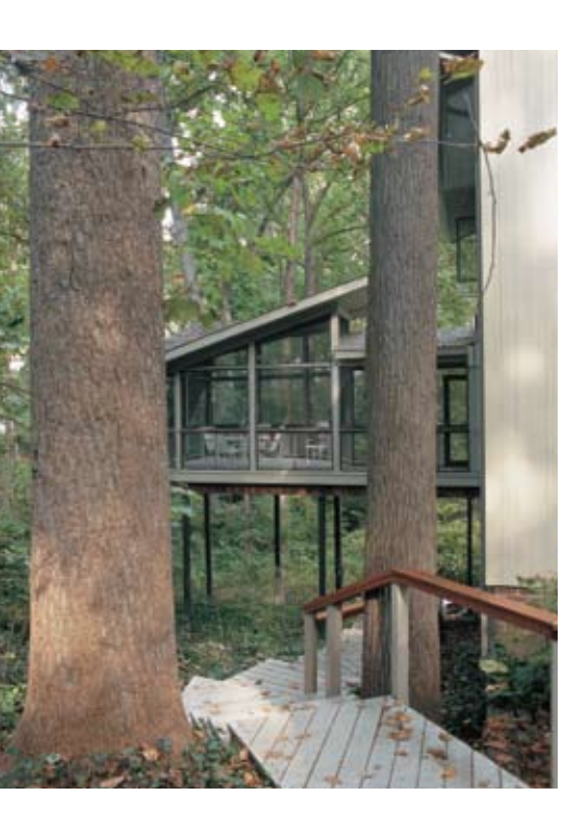
The porch beckons all the way from the other end of the house, where trees flank a walkway and frame a view of the distant space that seems to be floating in air.